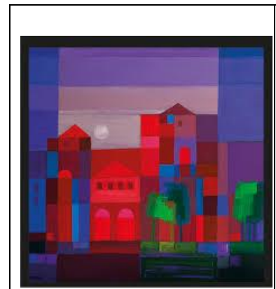
Ton Schulten Cityscapes 1988