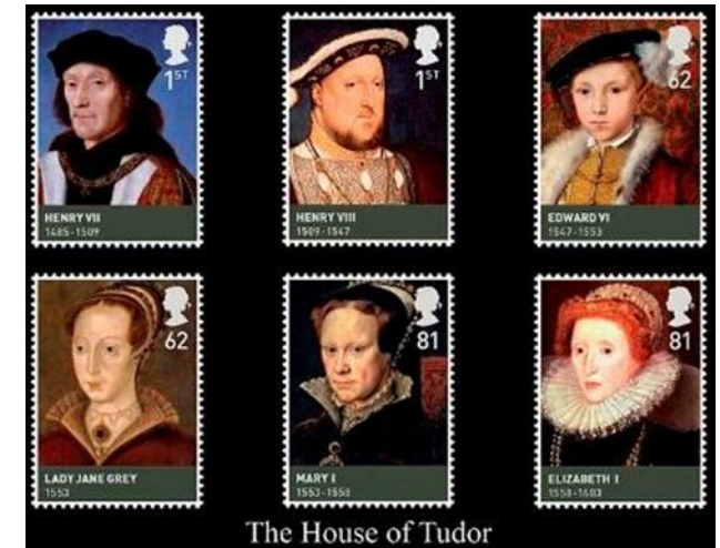
The House of Tudor